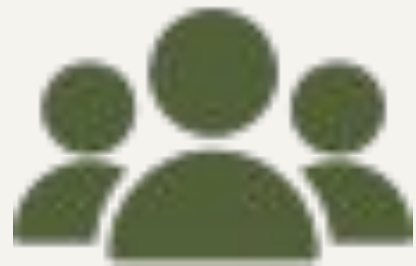
Assessment and Reflection