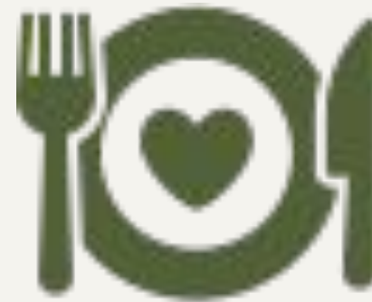
Community outreach and engagement