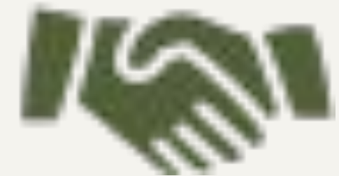
Inclusive governance and decision making