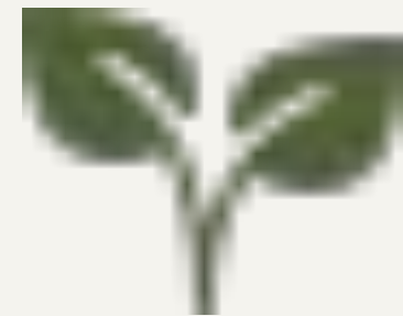
Ongoing Management and Support