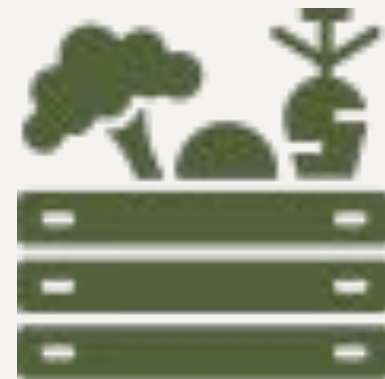
Equity and inclusion Initiatives